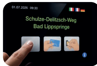
Also available with a 10-inch touchscreen!

At the same time, the project demonstrates just how flexible modern parking management can be today. RTB precisely meets individual customer